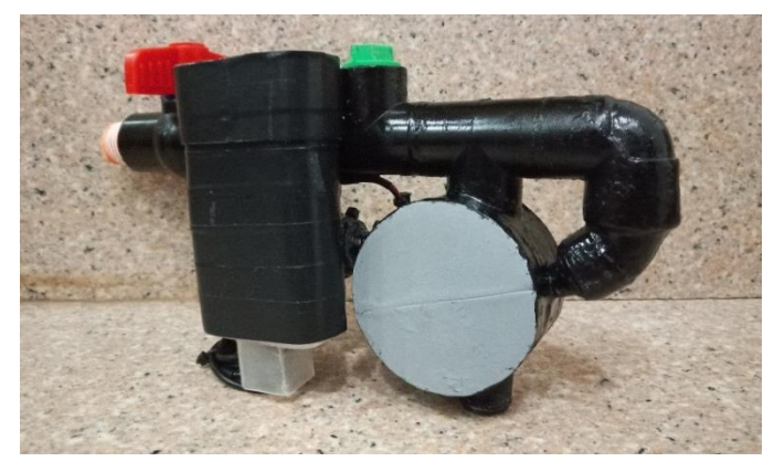
Fig. 3. The electricity-generating water faucet with three-inflow pipes generator.

measuring the voltage and current output, the power output and power efficiency are computed. The results are shown in Table I.